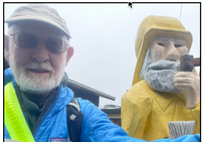
Old men gather here

Tour de Troll. Some Mountaineers long to visit all six freely accessible Thomas Dambo troll sculptures—NW Trolls: Way of the Bird King. The Danish artist "celebrates the human experience of art by amplifying the connections of cultural heritage between Coast Salish Tribal communities and Scandinavian traditions." Vashon, Ballard and Bainbridge are most accessible from the Seattle Olmsted Circuit. See Trolls