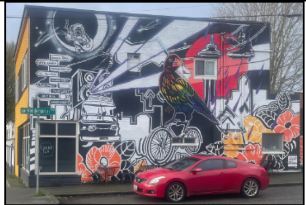
Bird on a Wire Mural

For public transit options, public bathrooms and treats see directions, last page.