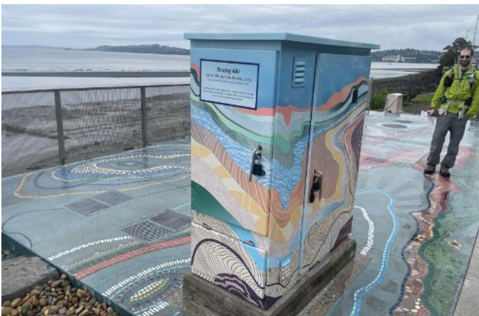
Tracing Alki, Pump Station 38