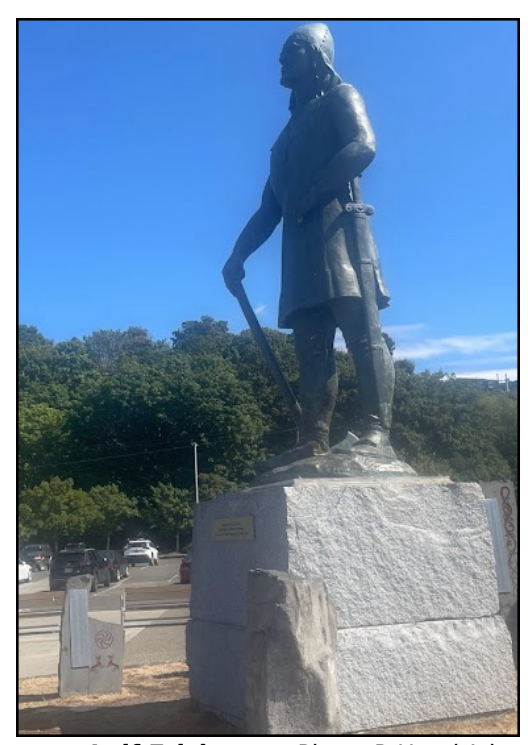
Leif Erickson