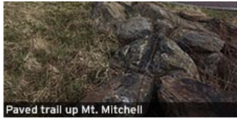
Paved trail up Mt. Mitchell