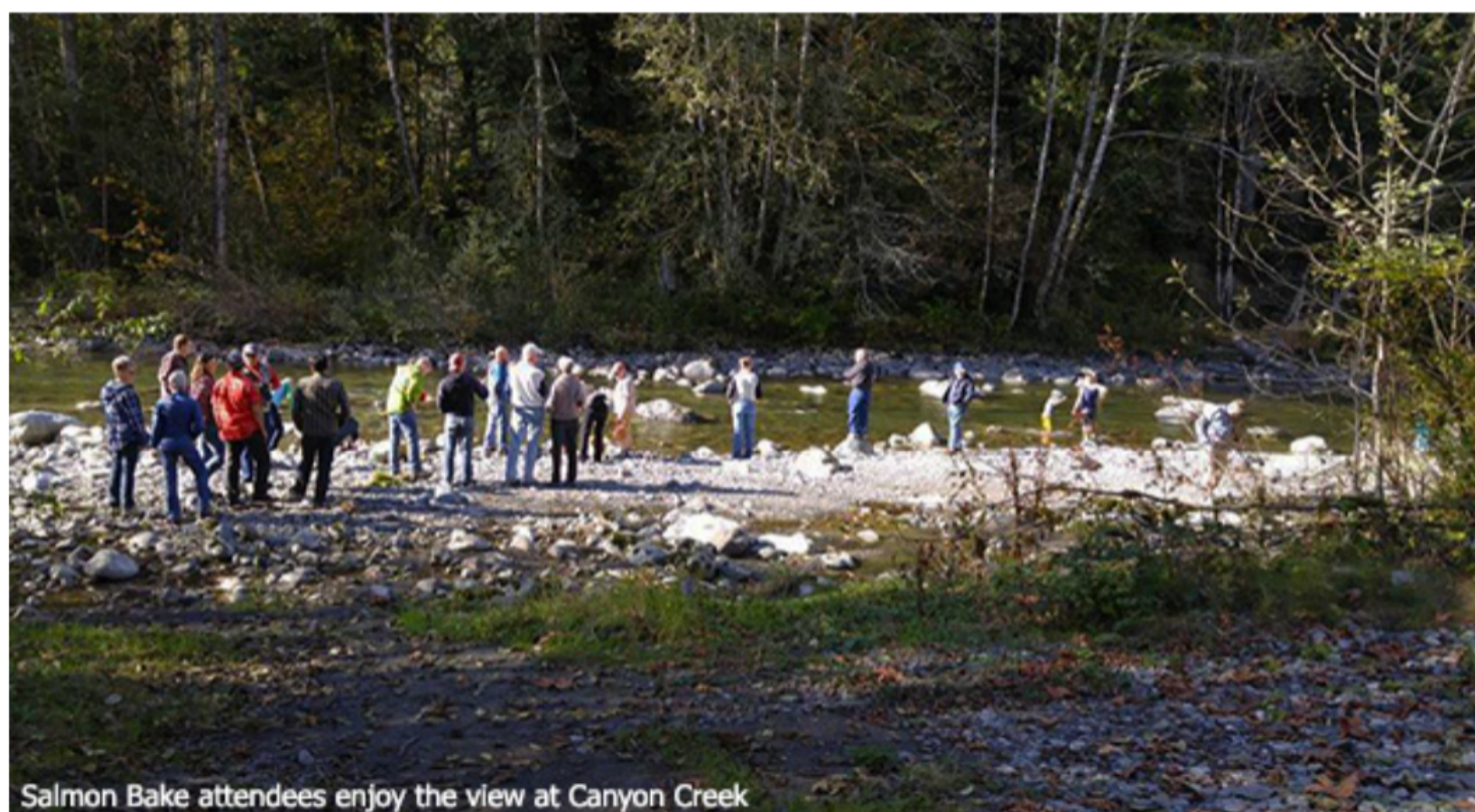
Salmon Bake attendees enjoy the view at Canyon Creek

Don't let winter escape! This event will showcase the season's upcoming courses. Representatives from our avalanche, climbing, scrambling, skiing and snowshoeing programs will be on hand to make presentations and field questions. If you attended any of our courses last winter consider retaking it to practice and reinforce skills or take another course. Encourage friends and co-workers to attend as well. Event details.