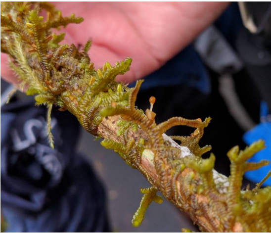
Examining an ephemeral liverwort fructing body for the moss workshop (it is the orange orb)