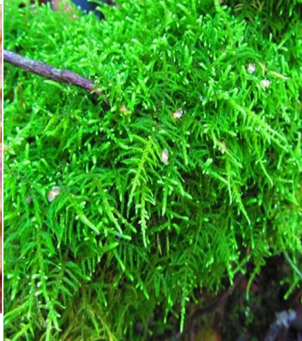
Stairsten moss Oregon Beaked Moss, Slender Beaked moss