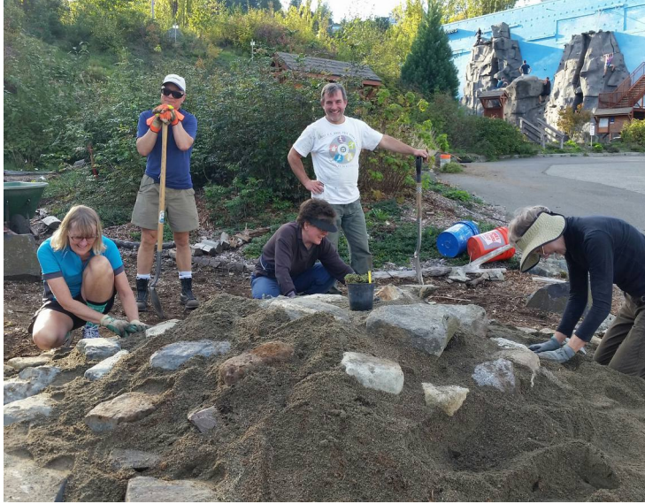
Building an alpine garden area

Because we are growing only native plants in our garden we have an opportunity to learn about the growth habits and best cultivation conditions of different native plants. As usual we learn from our failures and this led us to mound our alpine garden and use a granitic sand base in the soil, to mimic more alpine conditions. We also learned what conditions were too good for some native species allowing them to take over larger areas than anticipated. Thus, we found an 'outbreak' of the yellow monkeyflower as it spread through and out of the wetter streamside conditions it favors, taking advantage of the wetter west side to thrive.