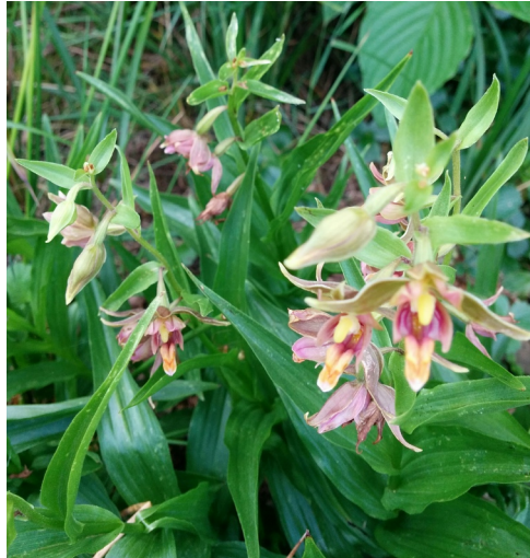
Alpine garden and stream orchid in our species garden