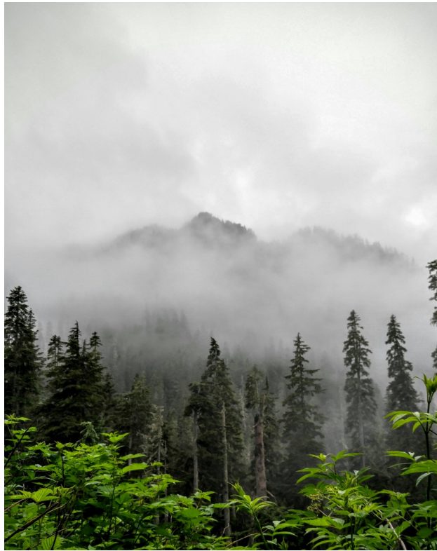
Surprise Lake hike