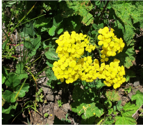
Alpine smelowskia and alpine wallflower on Mt. Townsend.