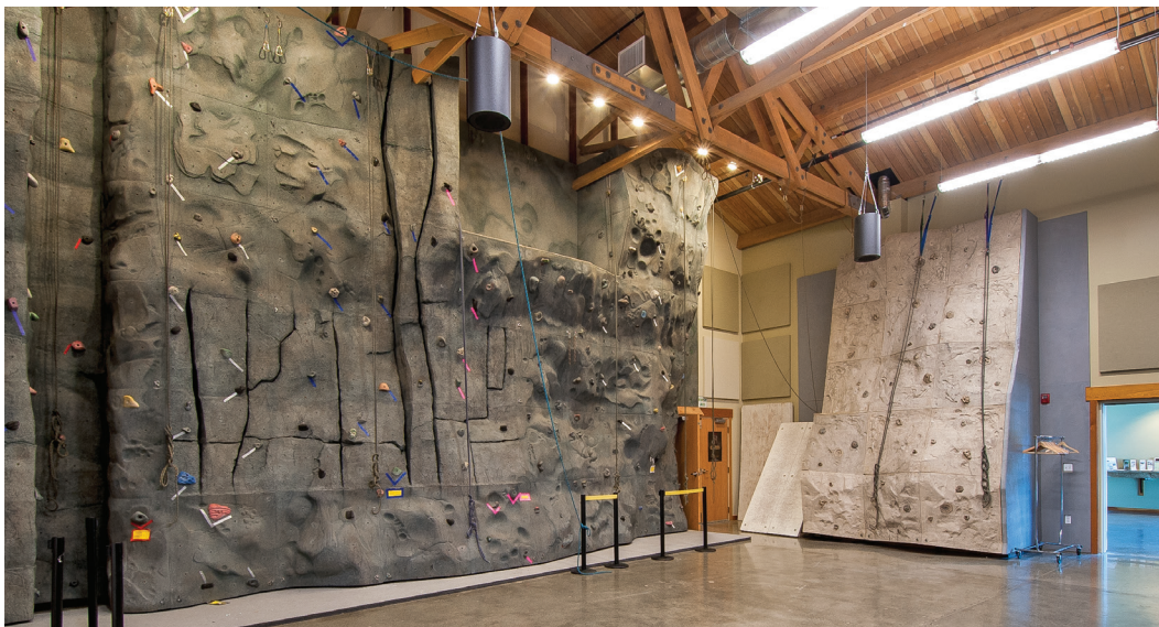
Top, left to right: Goodman A and B, looking north; Goodman C, looking south with climbing wall.