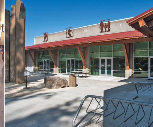
Top, left to right: Cascade room, program center lobby, and program center entrance.